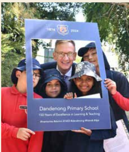
Brilliant to meet Dandenong Primary School leaders for 2024 – the school’s 150th year of teaching and learning excellence.