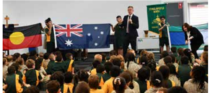
Flag presentation at St Paul Apostle North School in Endeavour Hills.

Fee-Free TAFE is transforming the lives of students from diverse backgrounds right across the country. And making sure there is a strong pipeline of workers to fill in-demand jobs.