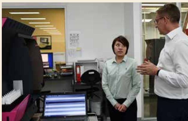
Inspecting new blood diagnostic technology at the Haemokinesis manufacturing business in Hallam.