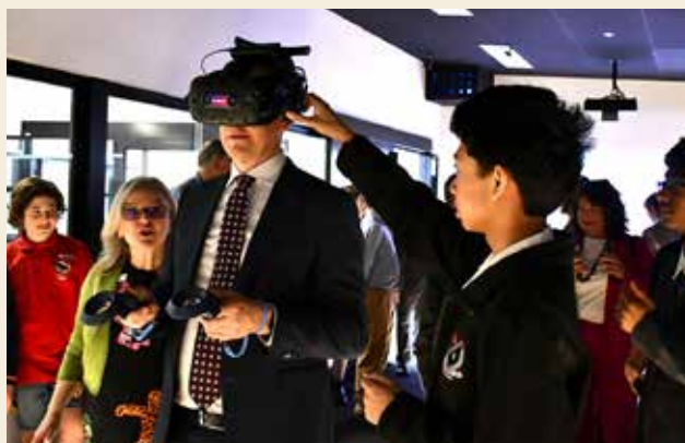
Augmented reality lab at Lyndale Secondary College in Dandenong North.