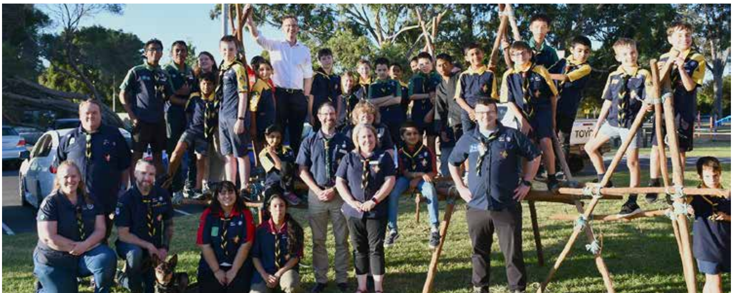
Learning new skills with the awesome Narre Warren Scouts.

Labor created Medicare. Only a Labor government will always protect and strengthen Medicare.