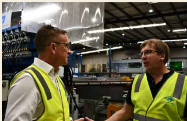
Talking about the challenges for local manufacturers at Ace Wire Works in Hallam.

For more information about saving energy, reducing your bills, and making your home more sustainable, visit www.energy.gov.au/households