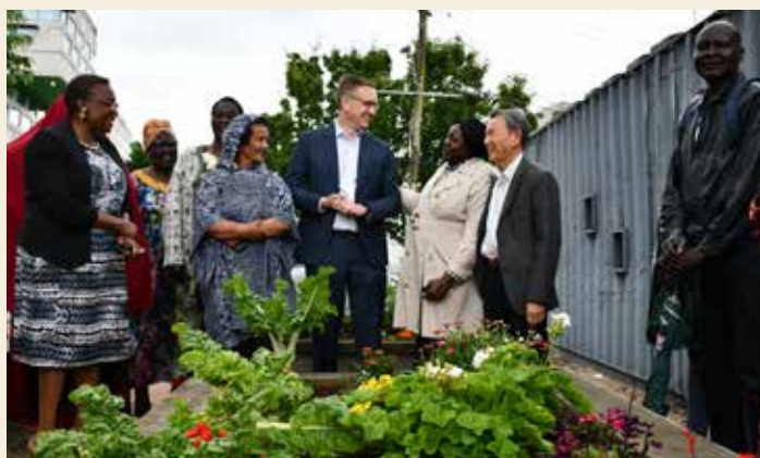
Afri-Aus Care Mamas urban garden in central Dandenong.

Labor will always defend the superannuation system as being good for workers, good for everyday Australians in their retirement, and good for the nation's economy.