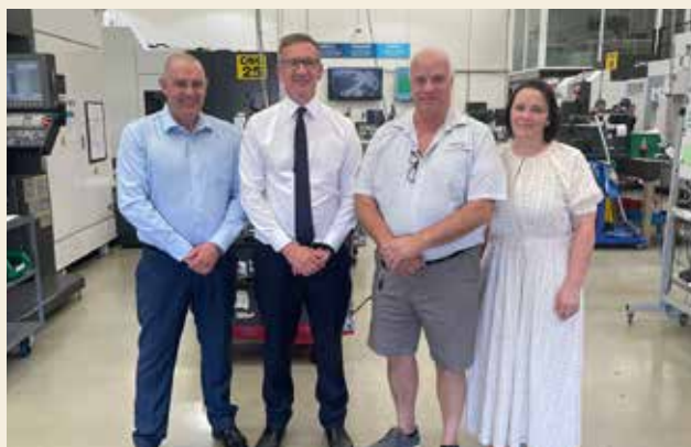
Discussing defence manufacturing at Australian Precision Technologies in Berwick.