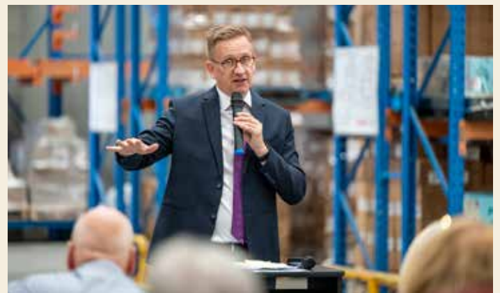
Opening The Bridge's new warehouse, a social enterprise providing jobs for people of all abilities.

The government is determined to assist with cost of living pressures and help people when they need it most.