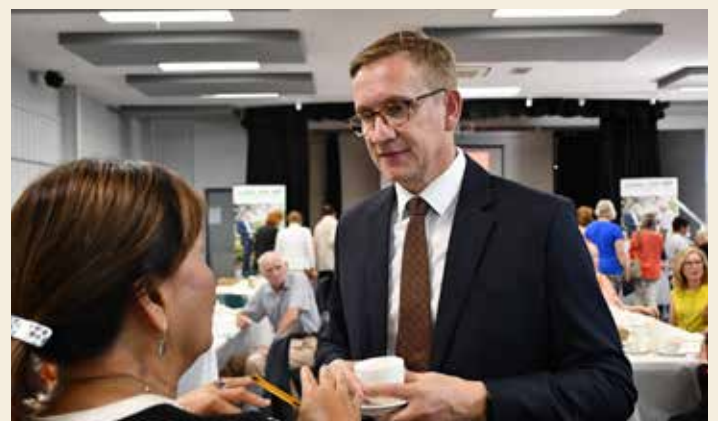
Community Morning Tea with Doveton locals.