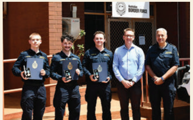
Helping keep our nation safe with Australian Border Force.