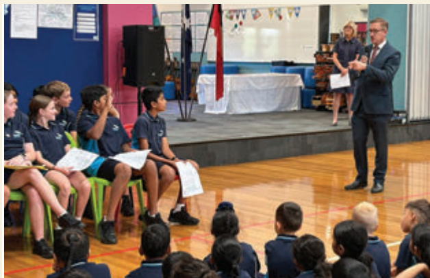
Presenting student leader badges at Tulliallan Primary School in Cranbourne North.