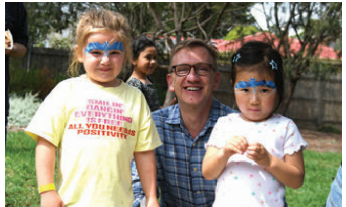
Meeting local families at the Dandenong North Community BBQ.