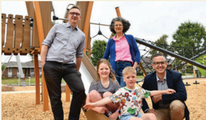
Checking out the new playground at Max Pawsey Reserve in Narre Warren.