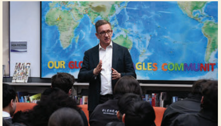
Q&A session with Gleneagles Secondary College students in Endeavour Hills.