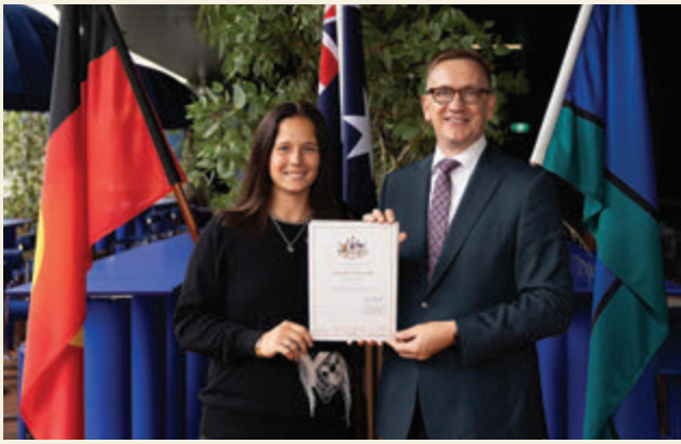
A special citizenship ceremony for Russian-born Australian tennis star Daria Kasatkina.