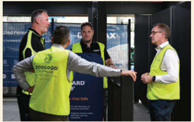
Meeting the team at Doogood Australia, Casey Business of the Year 2025, in Doveton.

In just six months there are already 3,415 new housing construction incentive program apprentices in Victoria – the most of any state.