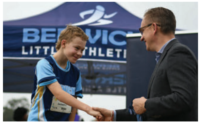
Presenting medals to winners at Berwick Little Athletics.

Narre Warren Medicare Urgent Care Clinic 60 Victor Crescent, Narre Warren 📞 9771 2020