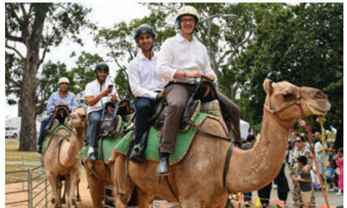
Learning to ride a camel at Afghan Culture Day in Dandenong.