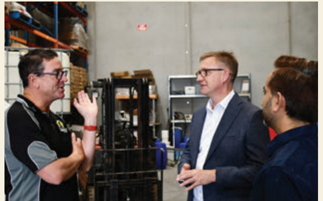
Visiting local manufacturer, Sure Seal Australia in Hallam.