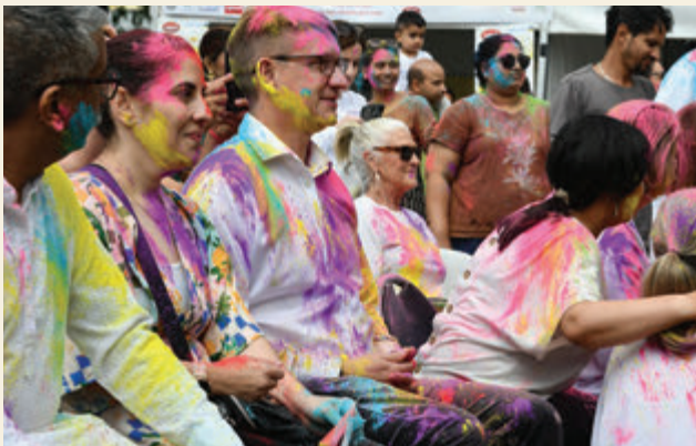
Taking part in the vibrant Holi festival of colours at Shri Shiva Vishnu Temple.