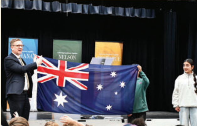
Flag presentation at Fleetwood Primary School in Narre Warren.