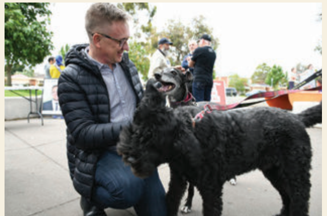
Patting new four-legged friends at a community BBQ.