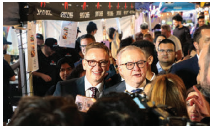
With Prime Minister Anthony Albanese at the popular Dandenong Ramadan night market.